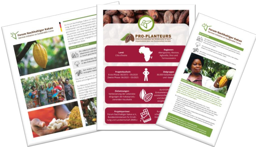
On the left, the new information brochures for Anuga: GISCO's flyer, the PRO-PLANTEURS factsheet, and the specific objectives.